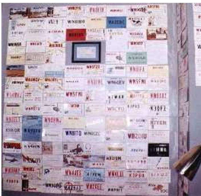
K3WWP 1963 Wall of Talk!